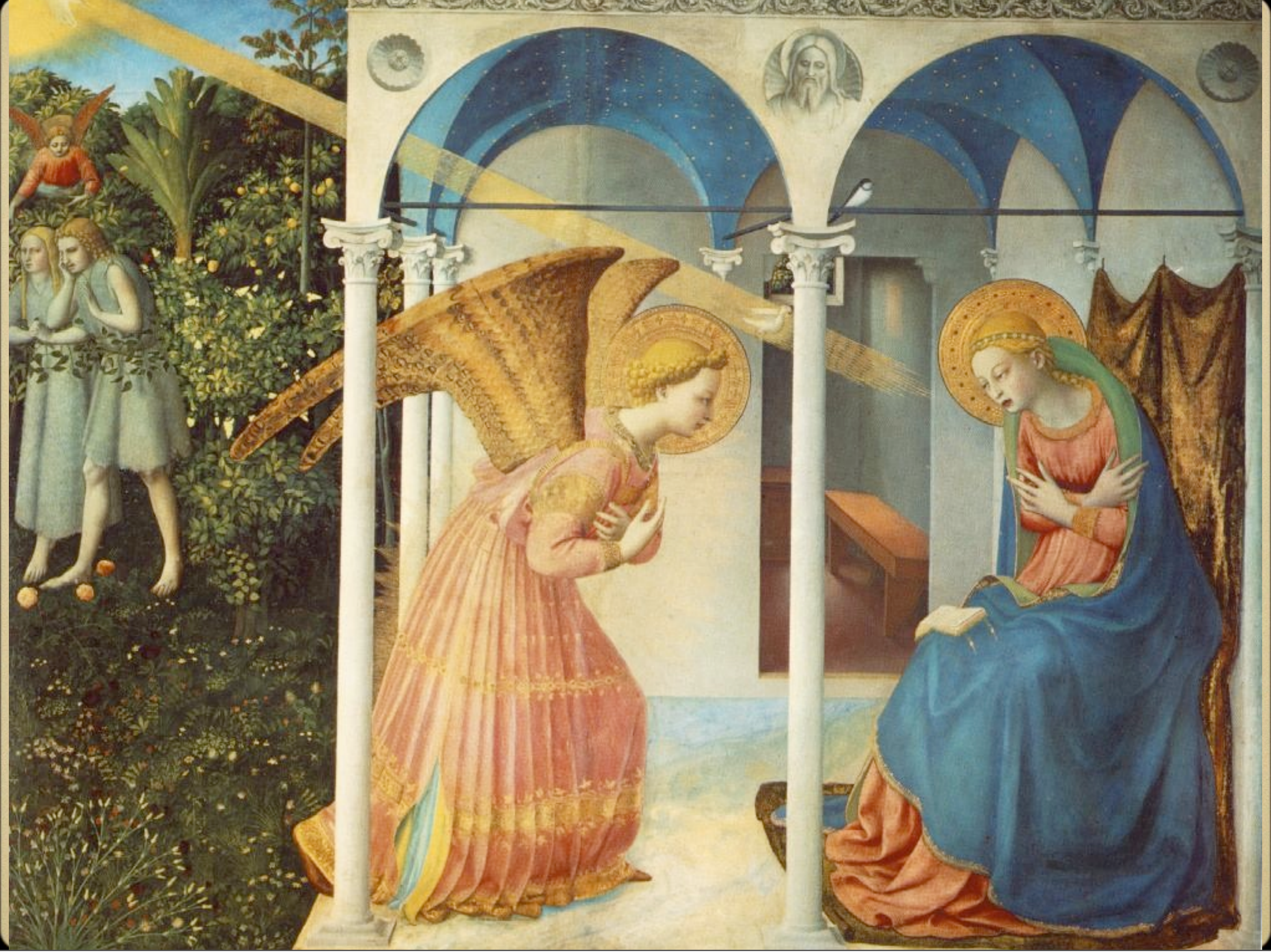
Monday, September 27, 2010