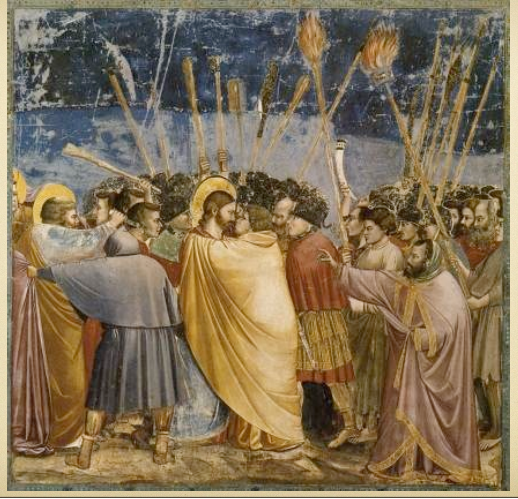
Monday, September 27, 2010